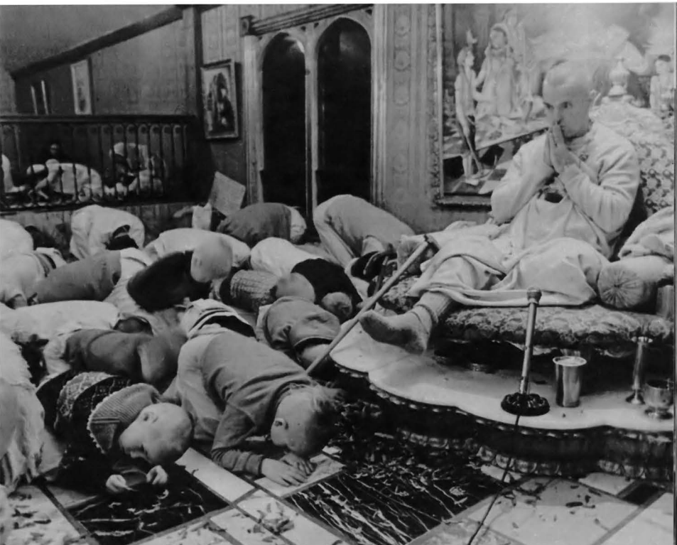
Morning worship starts at 4 a.m. Devotees chant, sing, offer food to their deities, listen to the swami's sermon and pray.

a string of 108 beads. For each bead, they must say a mantra. The process can be considered spiritually advanced and wear orange dhotis.