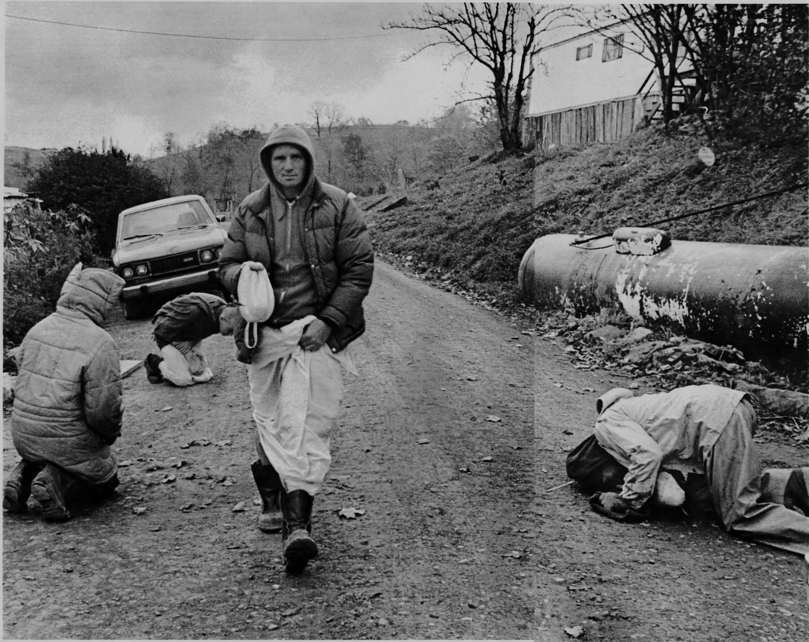
As one of New Vrindavan's holy men makes his way over the rutted landscape, lesser devotees pay homage. Almost everyone carries a cloth bag filled with

a string of 108 beads. For each bead, they must say a mantra. The process can be considered spiritually advanced and wear orange dhotis.