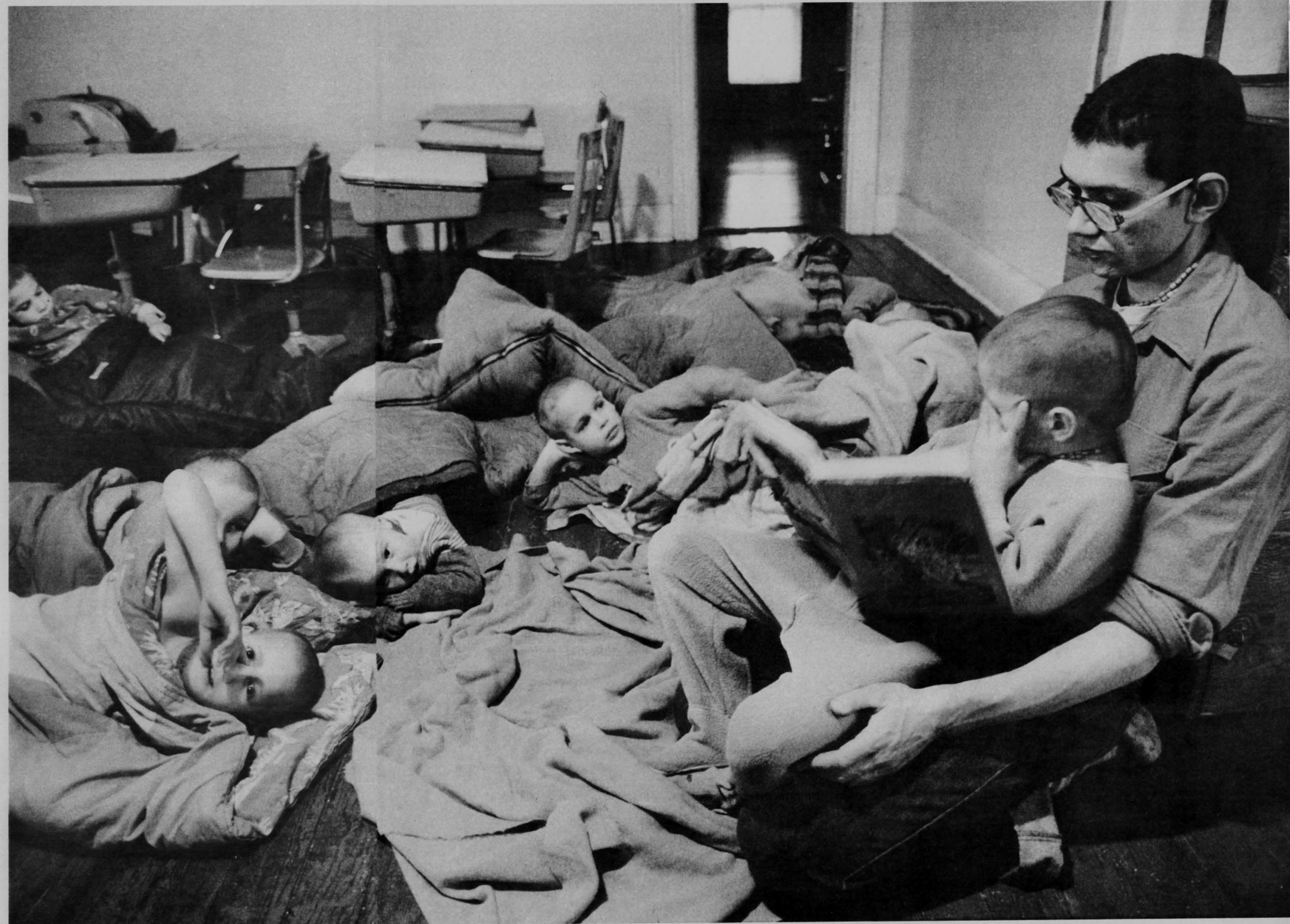
Most of those at New Vrindavan, including the children, sleep in sleeping bags on the floor. "Beds? They are very expensive and impractical," a devotee explains. Children are sent to sleep as early as 5 p.m., since they must rise at 3 a.m. to prepare for services. Above, boys listen to a classmate who reads from a sacred text. The teacher, one of four in the boys' school, says that several boys here are better readers than their peers in public school. Some parents, who reside elsewhere, simply have left their children to live among the devotees.