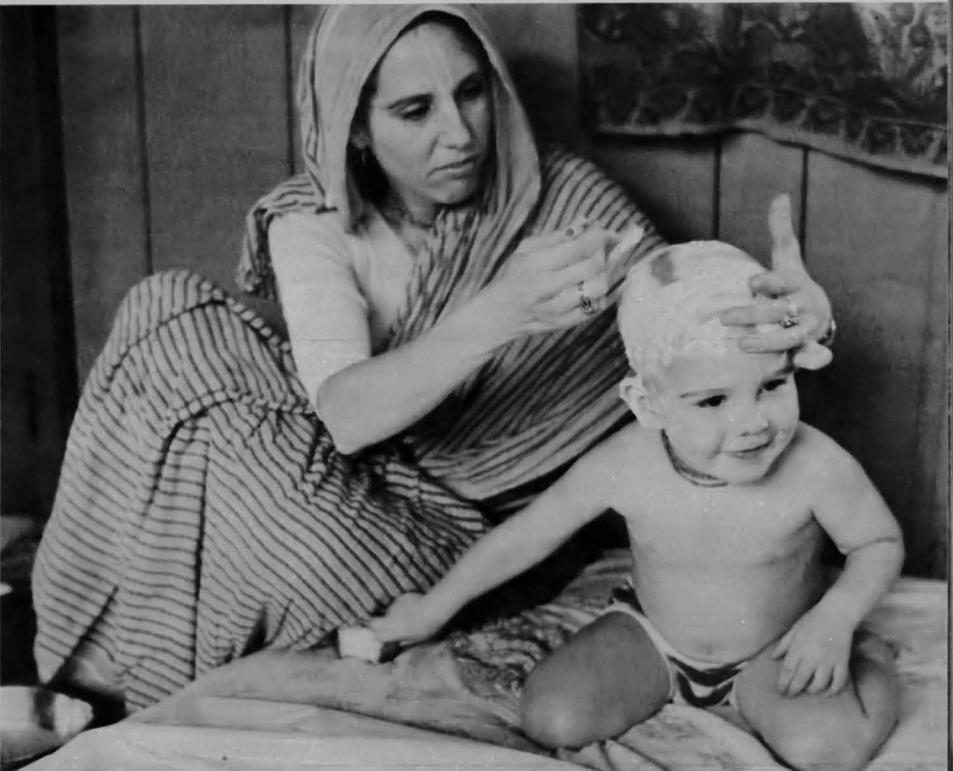
Males keep their heads shaved to foster humility and discourage vanity. This little boy reveled in having all his hair removed.

Inside the palace, followers visit a life-size plastic replica of Swami Prabhupada, the Indian guru who brought their faith to the U.S.